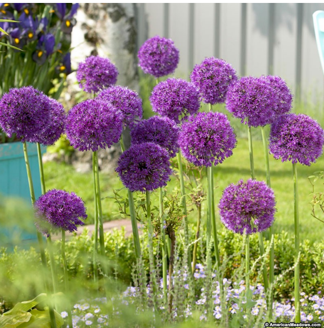
American meadows image