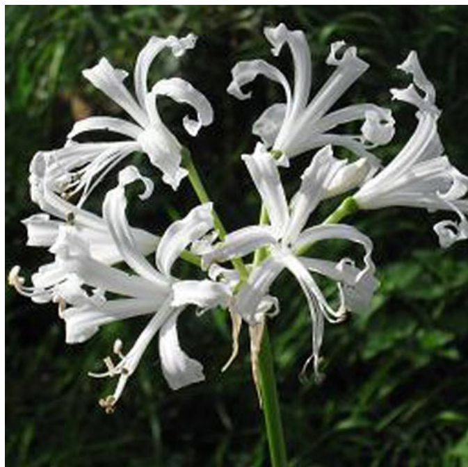
Riverside bulbs image