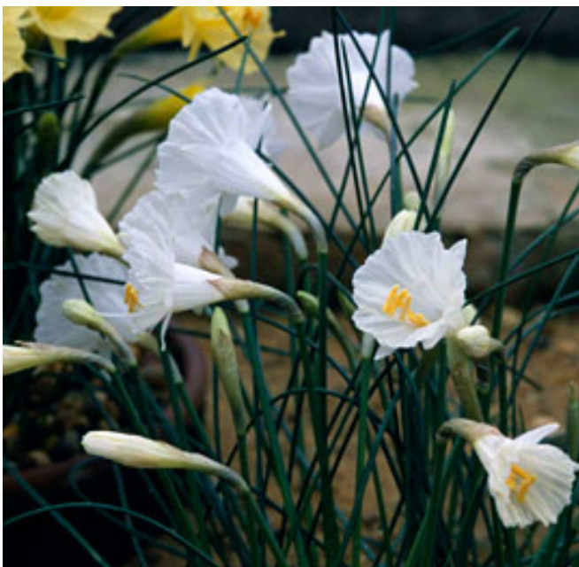
Alpine garden society image