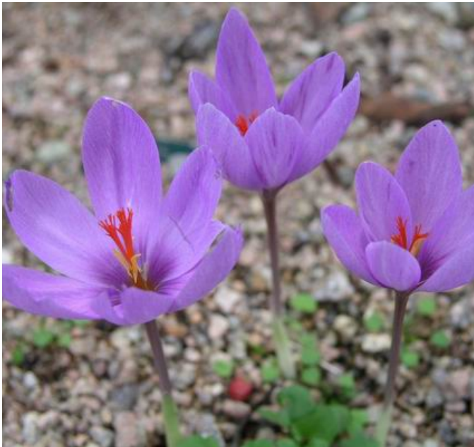
Scottish rock garden club image